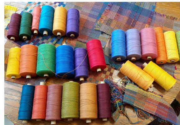
Double Rainbow Workshop color options

We offer: Monthly Meetings Programs Study Groups Workshops Library Scholarships for events and workshops Monthly Newsletter Equipment Rentals