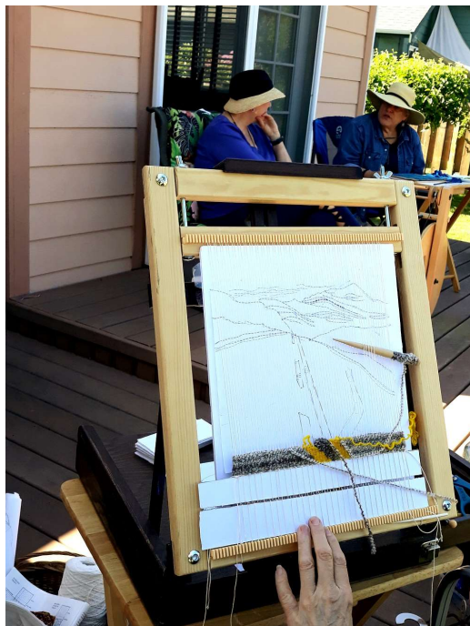
Tapestry weaving interest group